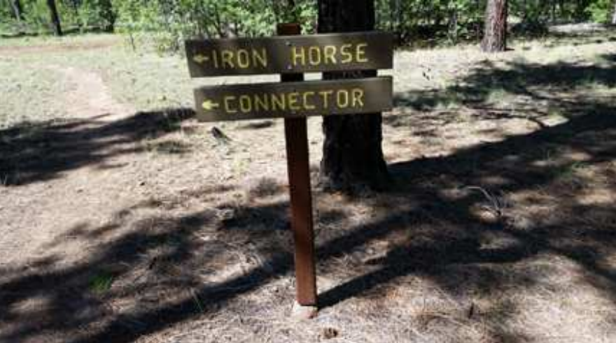
Old hard to read sign